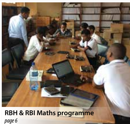
RBH & RBI Maths programme page 6