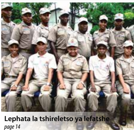
Lephata la tshireletso ya lefatshe page 14