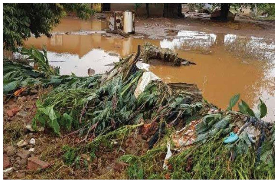
Ditshwantsho tsa ditlamorago tsa merwalela mo metseng e e farologaneng.