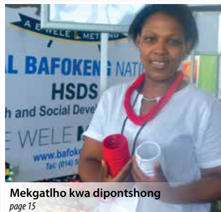
Mekgatho kwa dipontshong page 15