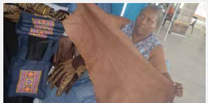
Moitso Creations: Mme Small Senqhi ke moroki wa moaparo wa setso o o akaretsang makgabe, diope, metlokolo jj.