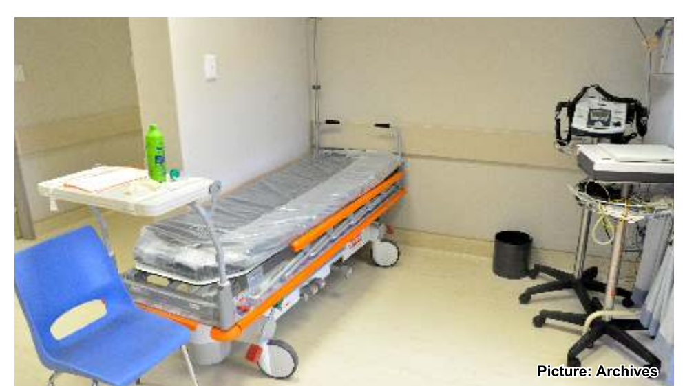
One of the newly refurbished consulting rooms of the Bafokeng Health Centre

Having spent time refurbishing department is now ensuring timely access to quality health care for all the members of the community.