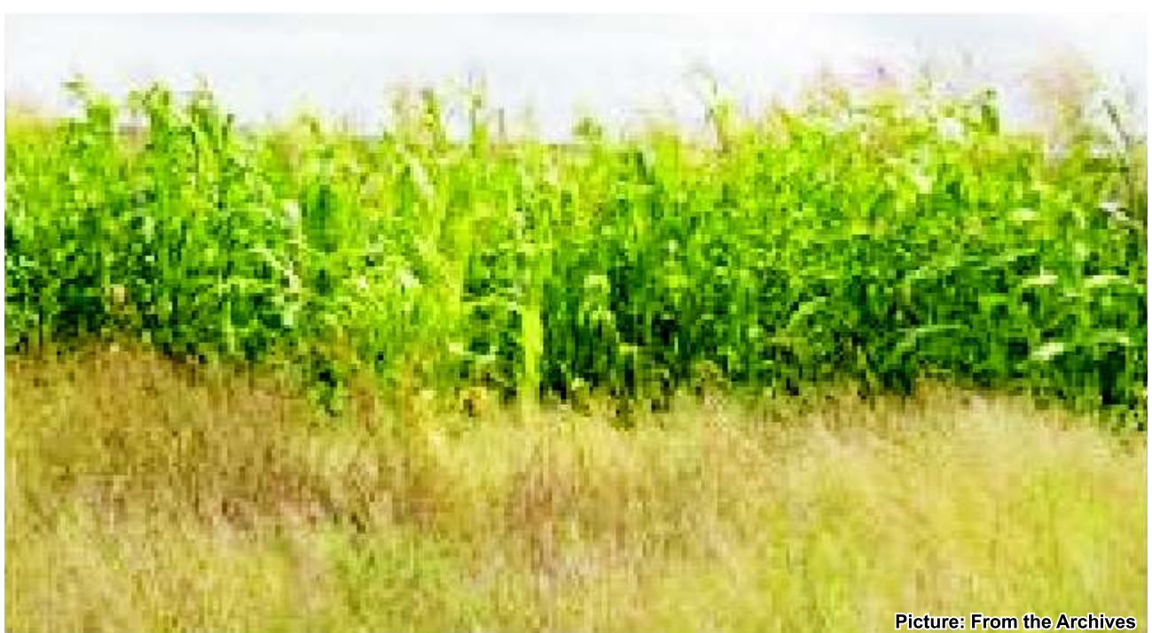
While agriculture in villages like Rooikraal is taking place, overgrown weeds and grass are indicative of an indigenous knowledge base that has fallen by the way-side.

Kgosi Leruo Molotlegi, the current monarch of the Nation, says, "I look forward to the day soon when the vegetables, fruits, meats, eggs, and dairy on our tables all bear the Bafokeng brand."