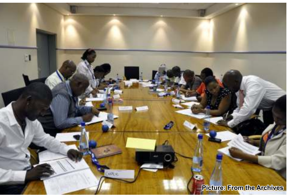
Local Business owners who attended the ISO training workshop at RBED

He added that as a management tool; ISO: 9001 helps companies to effectively and efficiently manage and sustain their businesses. "The SMME's should now go back to their businesses and implement what they have learned", he concluded.