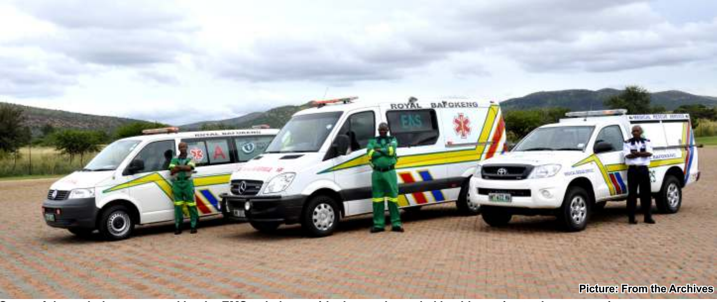
Some of the ambulances owned by the EMS to help provide the much needed health service to the community

available and provided free of charge in all public health facilities we are still experiencing a huge problem of growing numbers of TB cases in our area. The problem is that many people do not act quickly to get treatment, and those who do obtain the drugs often fail to complete the treatment.