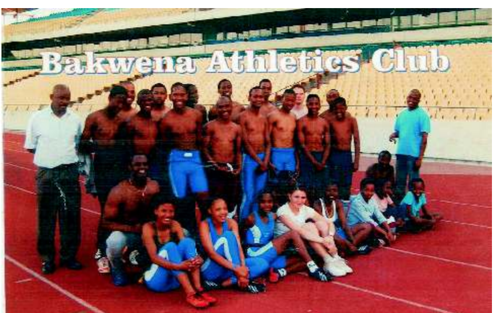
Bafokeng Athletics Club Members

The club is currently preparing its members for the 2012 Olympics which will be held in London, England.