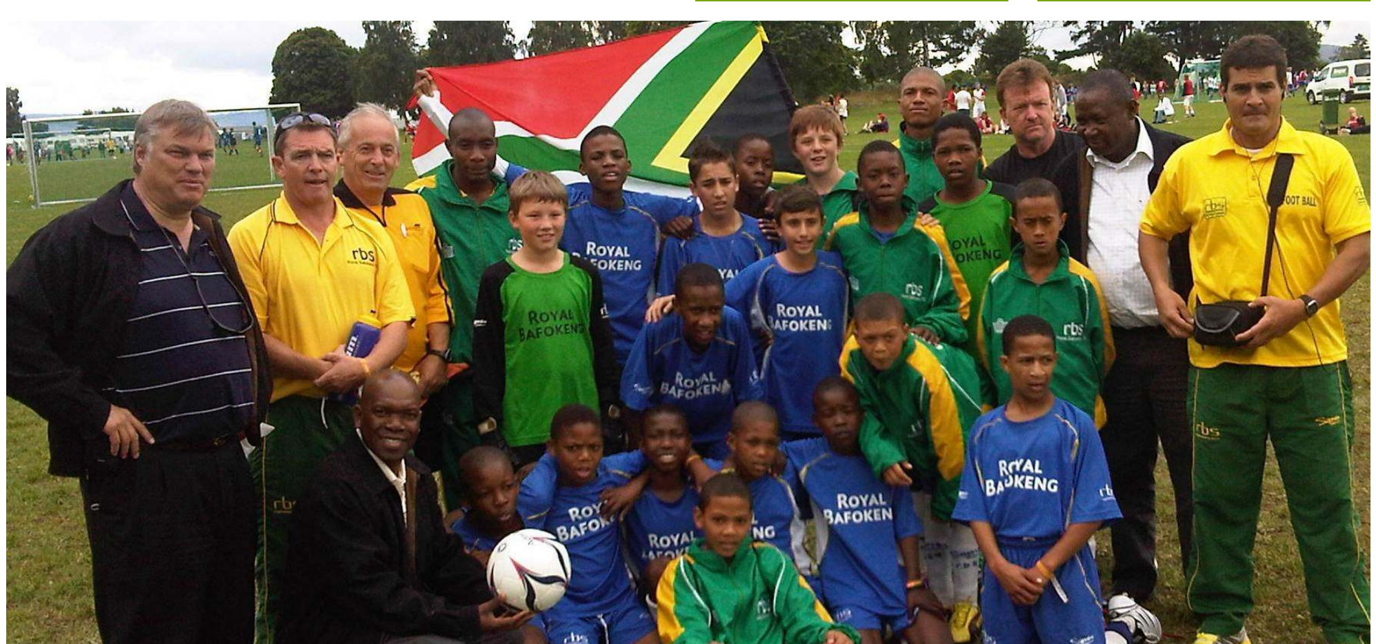
RBS management with the under 13 team that participated in the Norway Tournament

Royal Bafokeng Sports contact details Development office: 014 566 0000/15 Platinum Stars office: 014 573 4100(Club House) 014 566 0000 (Bafokeng Plaza)