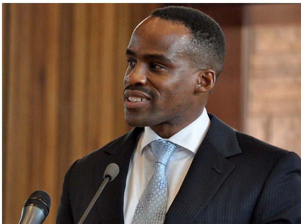
Kgosi Leruo Tshekedi Molotlegi

Vision 2020 and the Masterplan, the strategic blueprints for the community's future, aim to create a socially, economically, and environmentally sustainable community true to its African heritage and traditions.