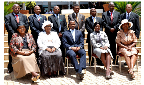
Bafokeng Traditional Council

Provides infrastructure and social services to the community