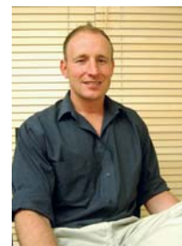
New Appointments 7