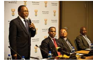
Parliament experience 4