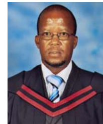
Staff Achievements 7