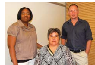
“If you cannot measure it you cannot manage it.” 5