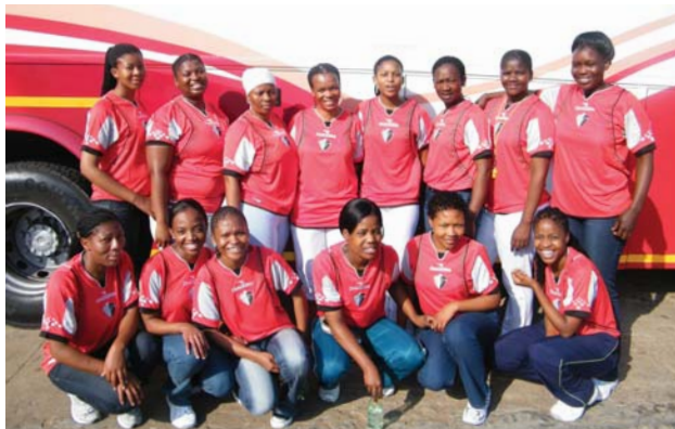
RBA Netball Team.

After raising funds for the anticipated tour to Maputo, the Royal Bafokeng Sports team has returned from Maputo with top honours. This was made possible by the CEO after Kgosi's approval. The team travelled to Mozambique for the 2009 Southern Inter Municipal Games that took place in Maputo from 5 – 12 September 2009