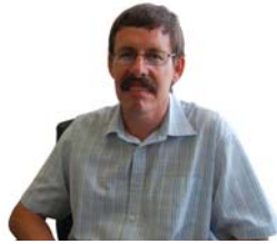
GIS to solve problems 3