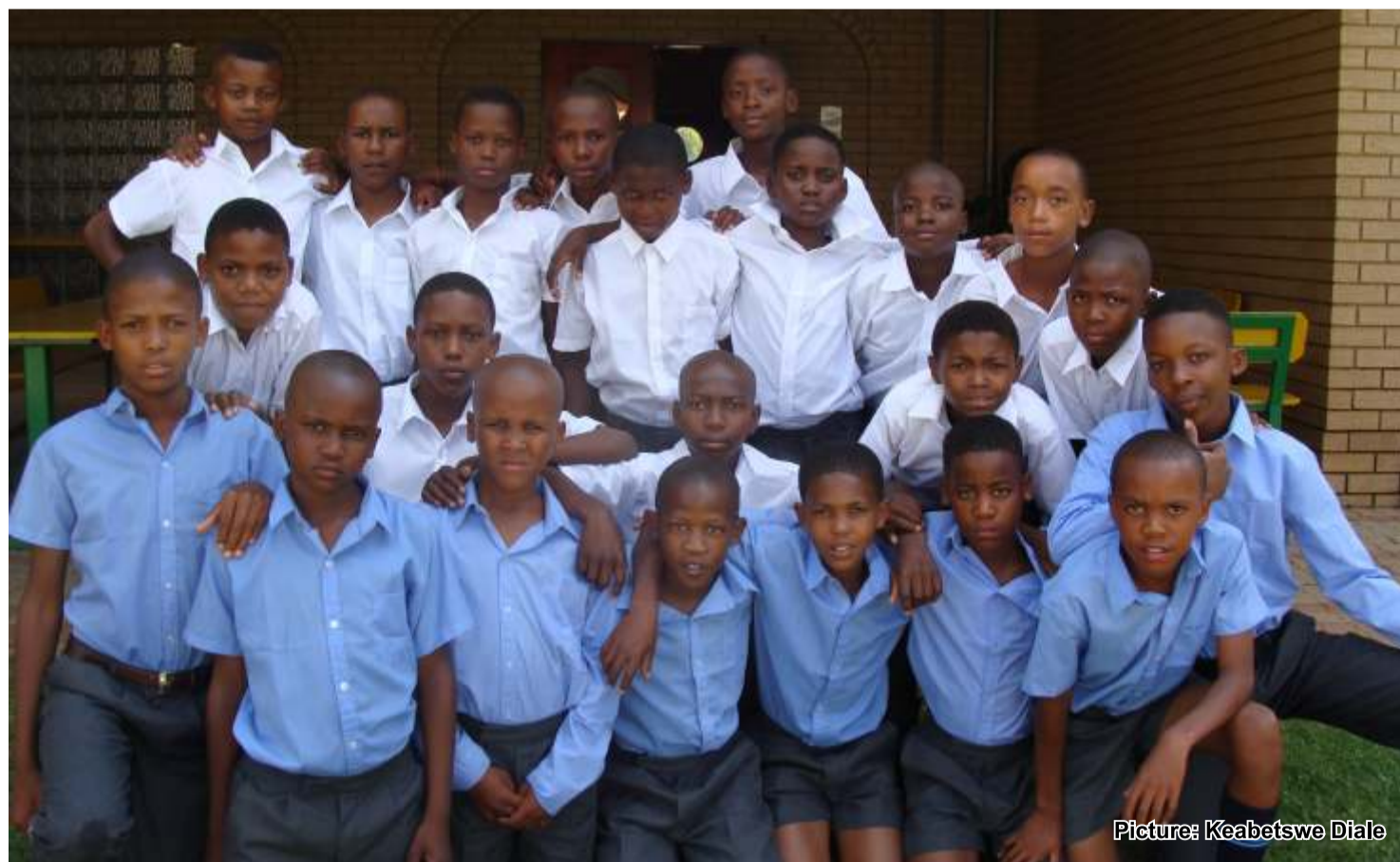
Academy boys on their first day of school

In addition to developing these boys' talent to their full sporting potential, the boys will be provided with accommodation, balanced meals and medical care. Fourteen of the boys are pupils at Seolo Junior Secondary School and eight of them attend school at Tlaseng Primary School. Their school uniform as well as casual wear, training kits and school fees are also provided by the sports academy.